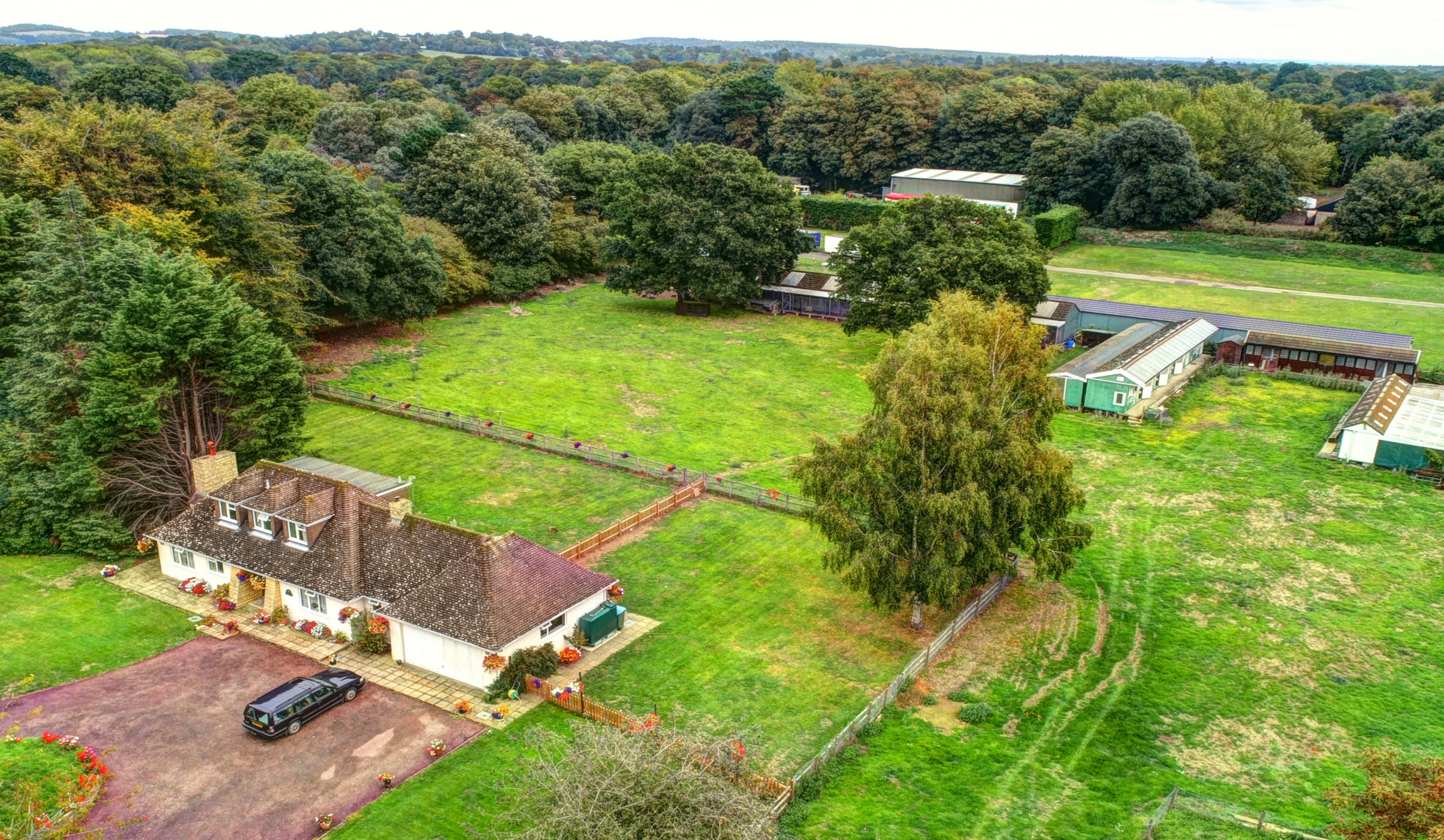
The Paddock, Little Heath Road, Fontwell, West Sussex, BN18 0SR