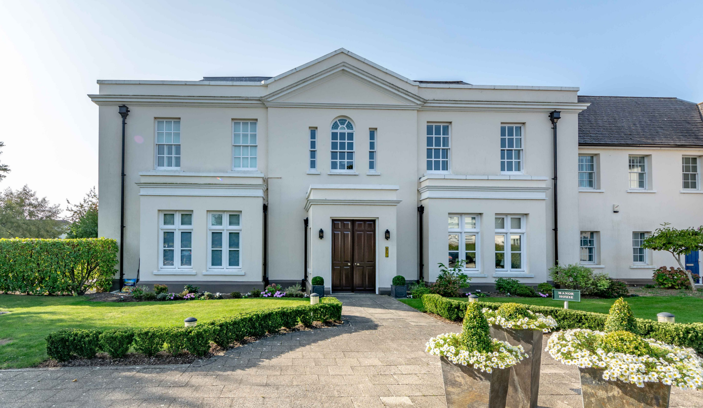
1 The Manor House, Tortington Manor Ford Road, Arundel, BN18 0FA