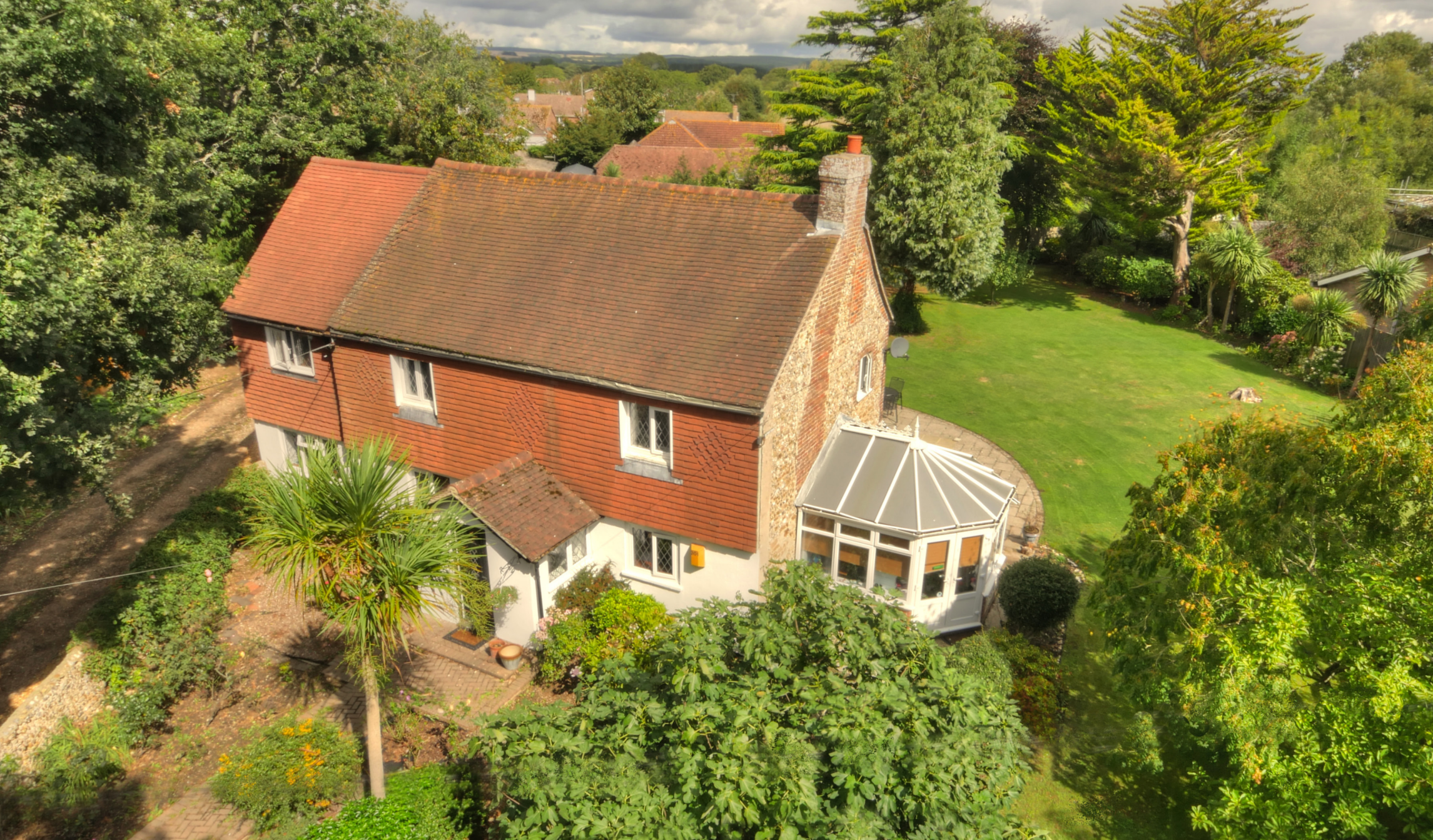
Caigers Cottage, Westergate Street Woodgate, West Sussex, PO20 3SQ