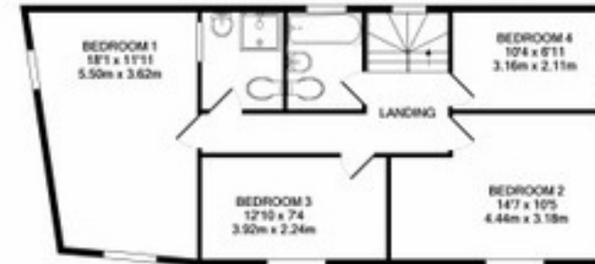
1ST FLOOR APPROX. FLOOR AREA 650 SQ. FT. (60.4 SQ. M.)

TOTAL APPROX. FLOOR AREA 2526 SQ. FT. (234.7 SQ. M.)