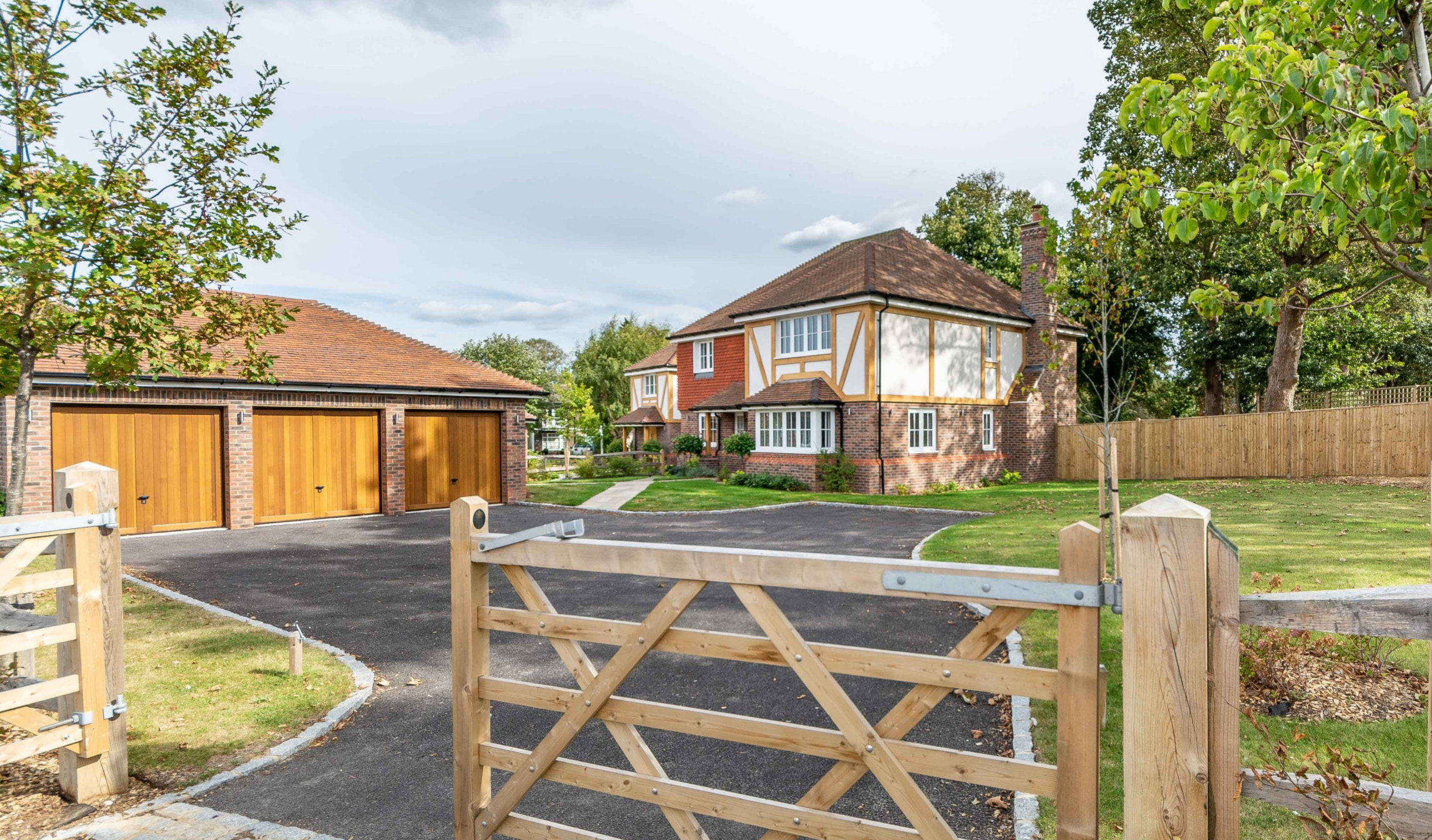
Huntingdon House West Drive, Angmering, West Sussex, BN16 4JE