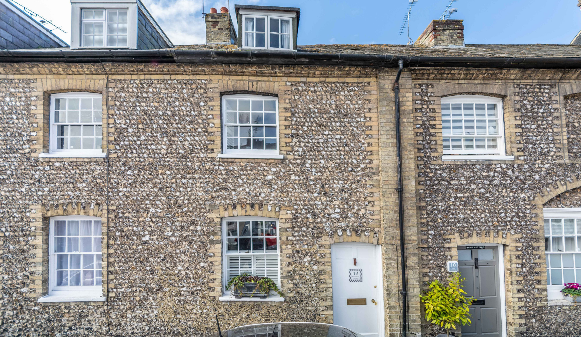
Knapstone Cottage, 12 Arun Street Arundel, West Sussex, BN18 9DL