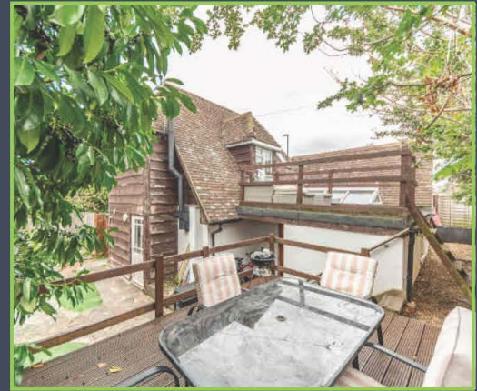
3 Bedroom Detached Cottage £450,000 Freehold