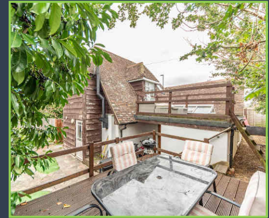
3 Bedroom Detached Cottage £475,000 Freehold