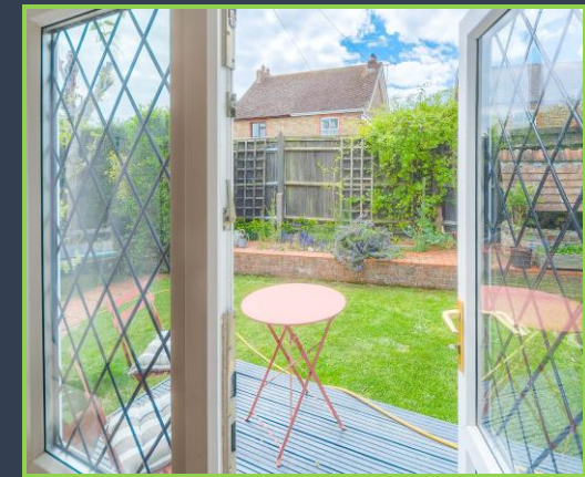
3 Bedroom Detached Chalet Bungalow £650,000 Freehold