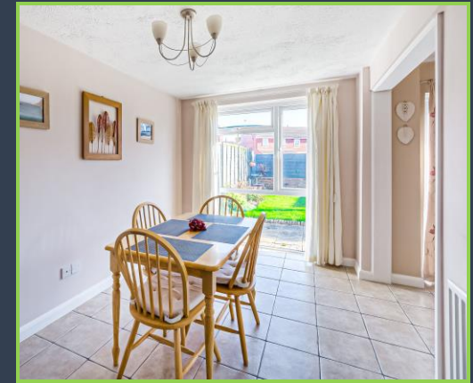
3 Bedroom Link-Detached House £375,000 Freehold