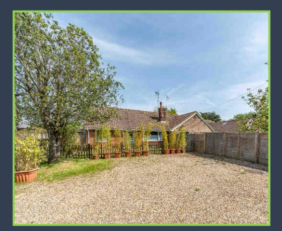
2 Bedroom Semi-Detached Bungalow £425,000 Freehold