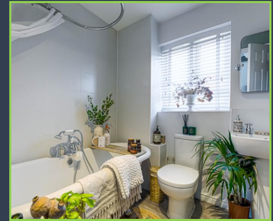
3 Bedroom End of Terraced House £355,000 Freehold