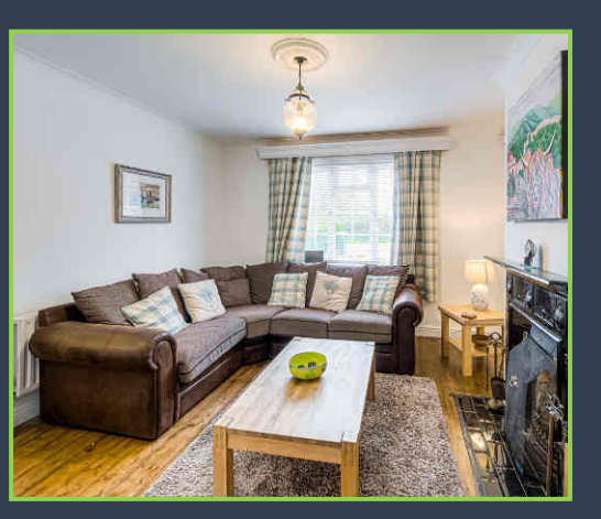
3 Bedroom Semi-Detached House £450,000 Freehold