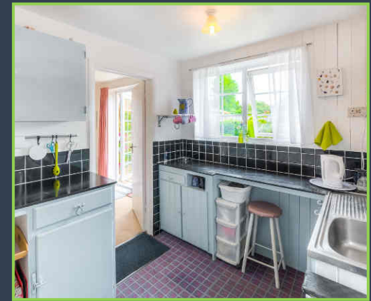
2 Bedroom Semi-Detached House £325,000 Freehold