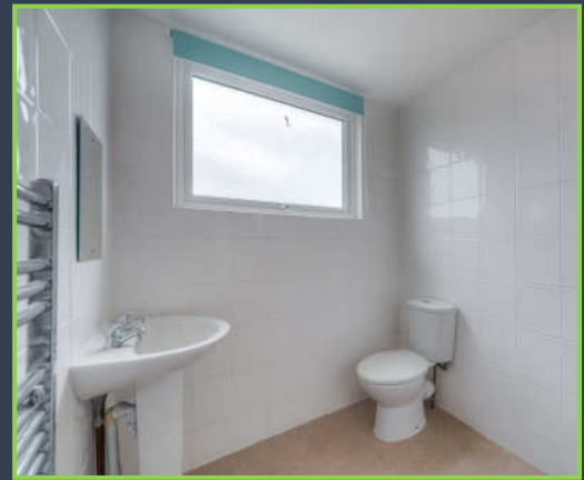
2 Bedroom End of Terraced House £299,950 Leasehold