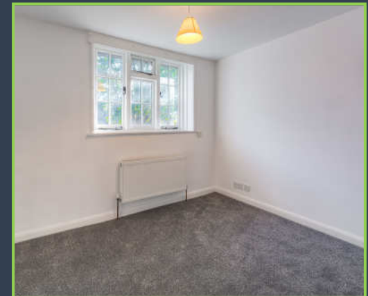
2 Bedroom Cottage £450,000 Freehold