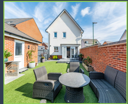
3 Bedroom Detached Home £475,000 Freehold