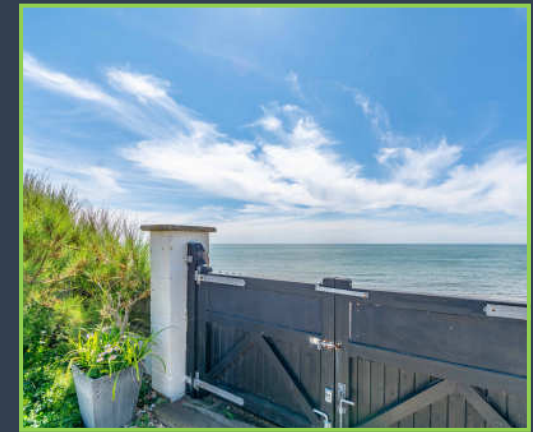
5 Bedroom Detached House £1,550,000