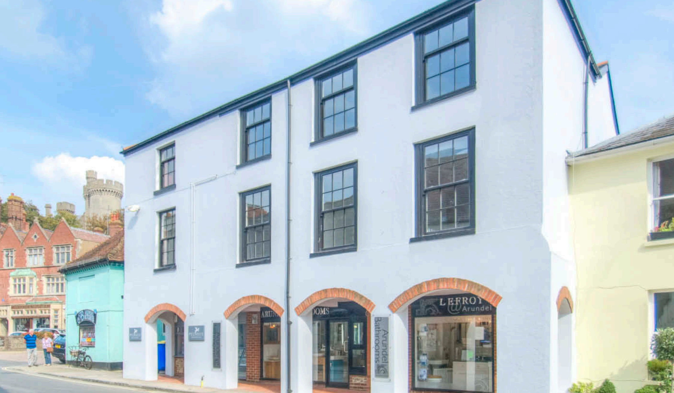
The Old Coach Works, Arundel, West Sussex, BN18 9AD